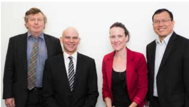
Catholic Super investment management team

Continuation of very easy monetary policy in major world economies (so-called quantitative easing) saw cash rates maintained at a minimal level throughout the year in major developed economies such as the US and UK.